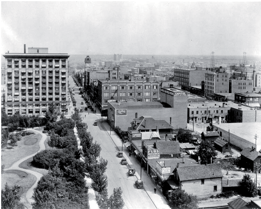
Above: A view from the Hotel Saskatchewan circa 1940 - Looking north along Scarth Street