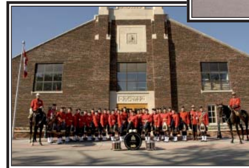
Left: RCMP Training Academy and Heritage Centre - included in the partner's program