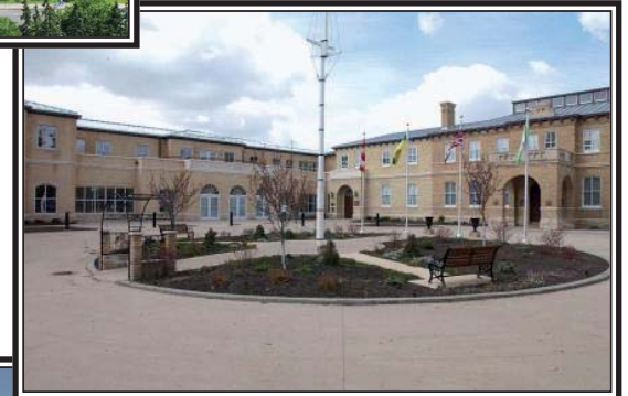
Right : Government House Where the Lieutenant Governor will host a reception on the evening of March 25 th