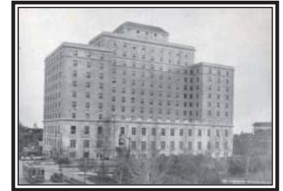
Left and Above: Hotel Saskatchewan - Host of numerous SLSA AGM's over the years, now including the 100 th