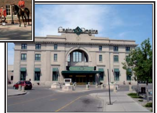
Right: The historic CP Rail station, now home to Casino Regina