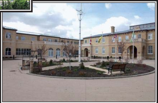
Right : Government House Where the Lieutenant Governor will host a reception on the evening of March 25 th