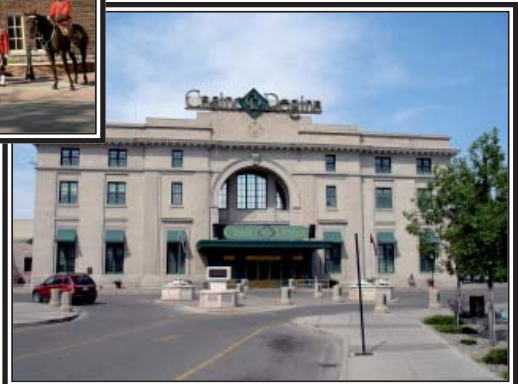
Right: The historic CP Rail station, now home to Casino Regina