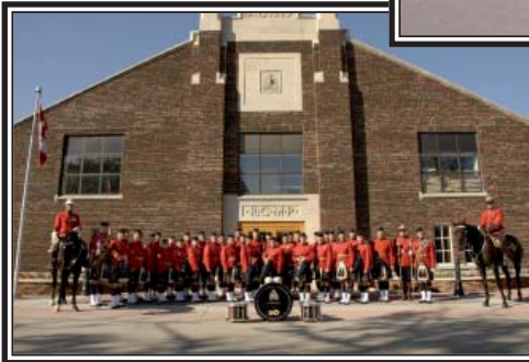
Left: RCMP Training Academy and Heritage Centre - included in the partner's program